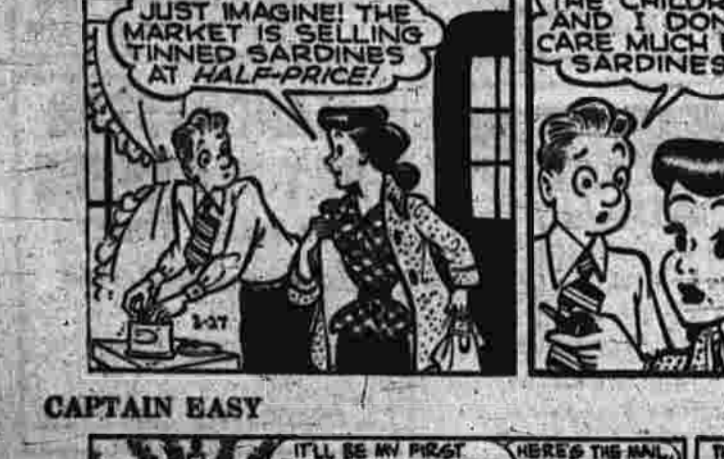
JUST IMAGINE THE MARKET IS SELLING THESE SARDINES AT HALF PRICE!