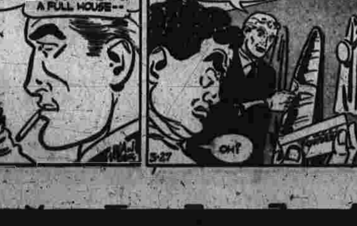
I'VE BEEN THINKING ABOUT YOU SINCE I SAW YOU LAST YEAR—YOU'VE GROWN UP!